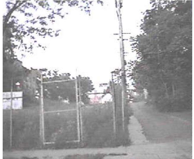
The site of the former Oxford Apartments